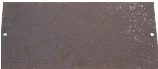
Figure 2. Salt coated steel sample after 500 cycles.

After 250 cycles, the non-covered steel samples showed several small red rust spots on the surface. The steel samples that were covered with CONDENSTOP® showed no visible changes. As expected, the salt coated steel samples showed significant acceleration of steel deterioration; they were heavily corroded and covered with thick, red-brown, iron-rich rust; the salt coated steel sheets covered with CONDENSTOP® however clearly showed significantly less deterioration than the non covered steel samples.