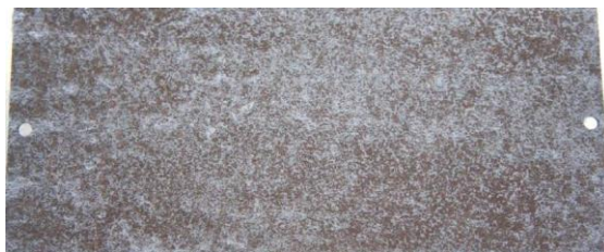
Figure 3. Salt coated steel sample with CONDENSTOP® after 500 cycles.

After 500 cycles, the non-covered steel samples showed relative large red iron-rich rust spots, viewing under the optical microscopic further revealed many very small rust-like features. These typical corrosion characteristics were rarely observed on the steel samples covered with CONDENSTOP®. The salt coated steel samples directly exposed to the lab atmosphere were heavily corroded as shown in figure 2; the surface morphology of the mild steel sample showed that red-brown, iron-rich, rust covered the whole surface. The salt coated steel samples covered with CONDENSTOP® however, while also corroded, showed significantly less oxidization than the bare samples, as shown in figure 3.